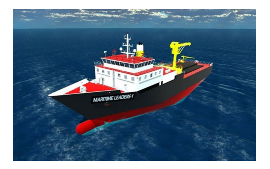
Figure 1. Outside view of M/V Maritime Leaders-1 ship