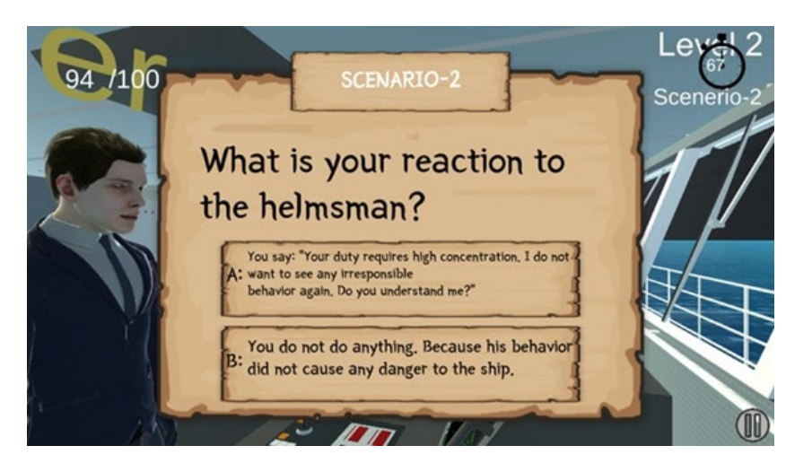
Figure 3. Challenge of the Level-2 Scenario-2

answers/reactions are assumed incorrect. An example of a challenge in the scenario and associated feedback for the wrong reaction are shown in Figure 3 and Figure 4 respectively.