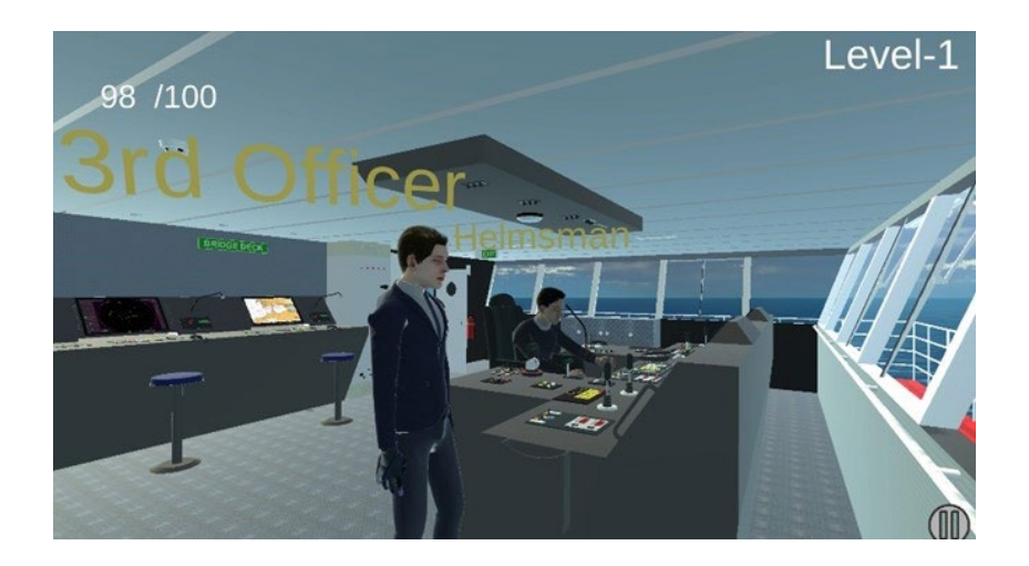
Figure 2. 3rd Officer and Helmsman during a navigational watch on the bridge

The game has three levels. In Level-1, there are four theoretical questions. In Level-2, the player is involved in five short scenarios of a navigational watch on the bridge. The reactions of the player to his/her teammates will affect their physical and/or mental conditions and thus their behaviours in Level-3, which is the main and the most challenging level of the game. In Level-3, the player is on a navigational watch sailing in Marmara Sea towards the entrance of Istanbul Strait from South. There is dense fog, which limits the visibility. Throughout the level, the player, as the master, will be involved in some cases where s/he needs to use leadership skills. Later in the level, M/V Maritime Leaders-1 will be involved in a risky situation with another ship and try to avoid collision.