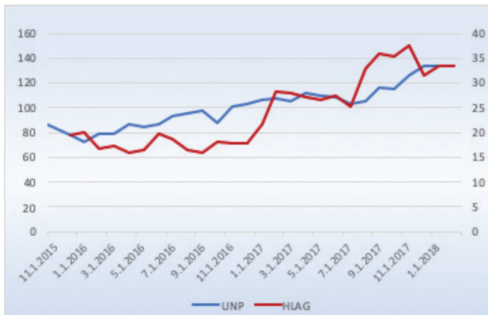
Figure 3. Cointegration Between HLAG and UNP.

Figure 3 presents a visual example of cointegration. This graph shows the interrelationship between HLAG and UNP since HLAG went public in 2015. The axes are scaled so that the left axis shows UNP's stock price. The right axis shows HLAG's stock price scaled four to one, so if UNP's price is 100, then HLAG's price is 25. Thereby anytime the lines cross, they are exactly at a four to one ratio. When UNP's price increases and HLAG's price drops in 2016, they are no longer at a four to one ratio, with UNP hovering above HLAG in the graph. By 2017 they are back at four to one, but later that year they are again out of ratio and HLAG is hovering above UNP. But again, they go back to the four to one ratio. This is an example of what cointegration entails – two series that wander apart, but in the long run move back together at an equilibrium ratio.