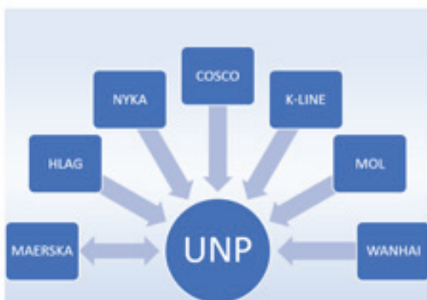
Figure 4. Direction of causality between UNP and maritime stocks.

The causal relationships between UNP and the maritime stocks are summarized in Figure 4. Based on both long-term and short-term relationships, the overall direction of causality largely goes from maritime stocks to UNP. For six stocks, there is a one-way direction of causality from the maritime stock to UNP, and for one case there is bidirectional causality. Figure 5 summarizes the relationship between JBHT and maritime stocks. The results are more mixed, but in four of the five cases maritime stocks have a causal impact on JBHT. On balance, maritime stocks appear to be able to predict UNP and JBHT much better than these stocks can predict maritime stocks.